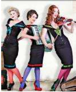
The Puppini Sisters

Other concert programme highlights included Ben Waters, Courtney Pine, Jacqui Dankworth, Axel Zwingenberger & Charlie Watts Band, Ben's Brother, Imelda May, Naturally 7, Camille O Sullivan, Drever, McCusker & Woomble, The Zombies, Curtis Stigers, Music from the Penguin Café Orchestra, Clare Teal, The Spooky Men's Chorale, Paul Carrack, The Leisure Society, The Unthanks, The Puppini Sisters, Bill Wyman, Jon Allen, Dan Berglund's Tonbruket, Andy McKee and Spiers & Boden.