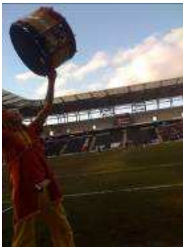
Rendezvous at StadiumMK

The KuDaMix Orchestra residency enabled us to achieve a specific aim in our education strategy of providing an intercultural project to attract a more diverse group of participants and audience members. In advance of the concert, musicians from the group and from 3 world music traditions worked with 60 pupils from 2 secondary schools to create 2 pieces of music. 20 of the students then performed one of the pieces as a concert curtain raiser, and joined the orchestra to perform the second piece in the concert finale.