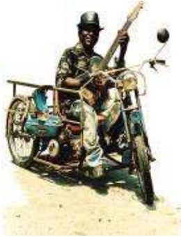
Staff Benda Bilili

and the outstanding Baroque ensemble Red Priest. We also presented an increased number of schools chamber music performances and pre-concert talks.