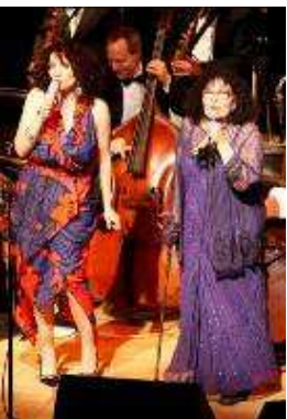
Dame Cleo Laine with Jacqui and Alec Dankworth at The Stables 40th Anniversary Gala Concert

Our 40 th anniversary was celebrated on the 6 th February with a gala concert of major artists including Victoria Wood, Timothy West, Prunella Scales, Dominic Miller, Rod Argent, Iain Ballamy, Lorna Dallas, Emma Johnson, Maureen Lipman, Tim Firth, Laurie Holloway, Jenny Linden, Martin Taylor and Paul O'Grady. The occasion was tinged with huge sadness as Dame Cleo Laine announced, with the support of Alec and Jacqui Dankworth, the passing of one of our Life Presidents and Founders, Sir John Dankworth, the same day. Tributes were paid world-wide and the support of dedicated staff and volunteers has helped steer the organisation through a challenging time.