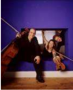
Kungsbcaka Piano Trio

The unrestricted and restricted activities referred to above resulted in the net assets of the Group increasing by £74k to just over £2.6 million at 31 st March 2010. Of this £549k related to unrestricted funds and £2,060k to restricted funds. Restricted funds are made up as to £23k provided for educational bursaries and £2,037k relating to the property. As before the major assets are the property and tangible assets of the Group, which are being depreciated over time in accordance with the Group's accounting policy. There was no fixed asset expenditure in the year. Net current assets increased by £74k to £238k and the bank loan was further reduced by £40k to £108k. The surplus for the year to 31 March 2010 will lead to a further acceleration of the bank loan repayment in 2010/11. Cash balances increased by £213k over the year to close at £1,163k. The surplus for the year of £74k plus non-cash depreciation costs of £47k made a major contribution to this increase. Also, amongst a variety of working capital movements, advance ticket sales increased by £76k. Advance funding from Arts Council England for the International Festival amounted to £147k at 31 st March 2010.