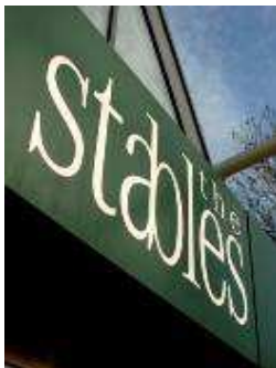
The Stables Theatre

The Charity was first established in 1970 to operate under the name of The Stables , with the objective of providing a centre of musical activity for the purposes of the promotion of education in, and appreciation of, good music of all kinds amongst persons of all ages and social backgrounds. Since that time the activities have grown significantly and The Stables has become renowned as a centre of musical excellence. Of major significance, with the assistance of Arts Council England, in 2000 a new auditorium was opened, followed in September 2007 by a second performance space and improved facilities generally.